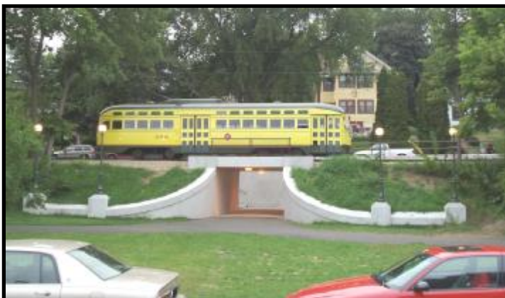
The Lights are On! The shop guys did great work installing the four lampposts flanking the east side of the Lake Harriet pedestrian underpass. Here is a great photo of PCC No. 322 crossing the underpass with dusk fast approaching.