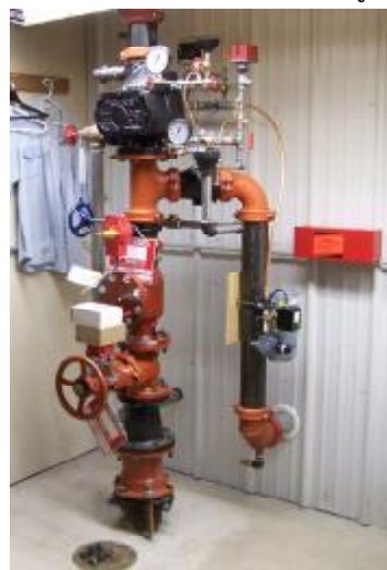
Sprinkler System Control Center

We have collected some parts for the truck that will be under Winona 10. The recent delivery of the traction motors along with axles and wheels rounds out some of the major portions of the truck fabrication. The original truck was a St. Louis Car Company truck, known as a model 46 truck. We have been fortunate in locating drawings for several versions of the truck that should help us to fabricate a replica. This work should start soon after the first of the year.