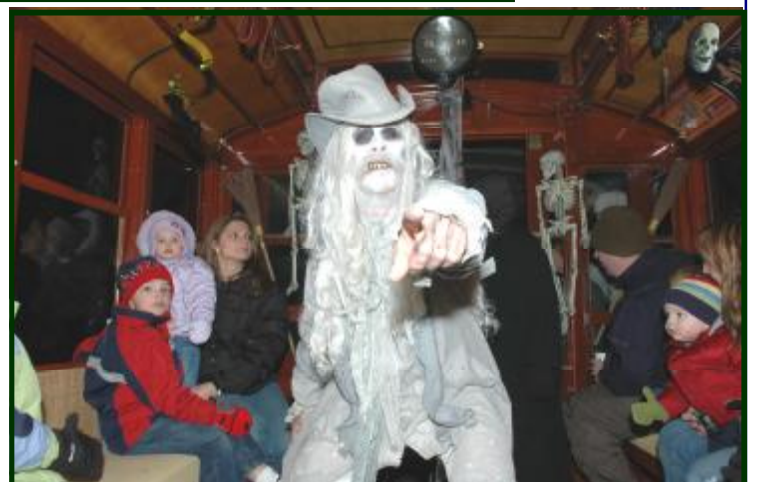
Watch out—or he’ll get YOU! Here is just one of the several scary creatures that haunted the Excelsior ghost trolley this year. Outside the ghost trolley passed by a graveyard during it’s run.