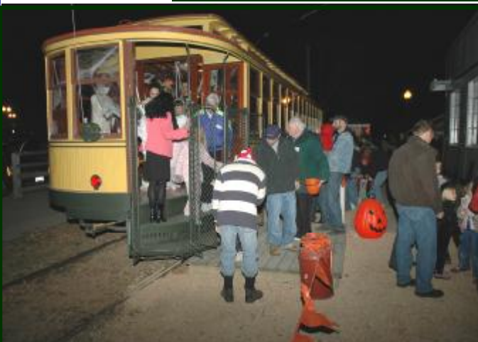
Capacity Crowds! Passengers board and alight from the rear platform of No. 1239 which did slow things down somewhat. But the people didn’t mind